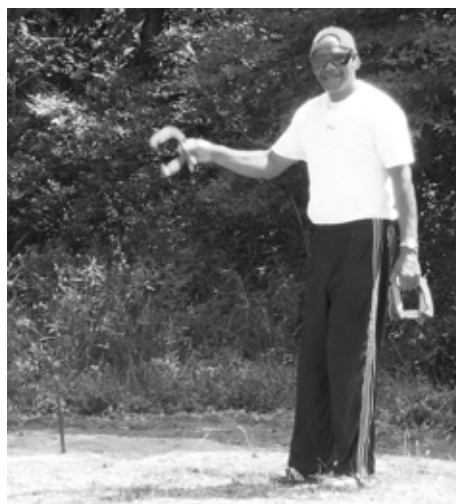
Top: Genworth volunteers and Lincoln Mews residents worked together to beautify the landscape. Bottom Left: Capital One volunteers painted all front porches and backyard fences at St. Andrew's Townhomes. Bottom Right: The new horsehoe pits at Carter Woods provide hours of entertainment for senior residents.

“It warms my heart that Capital One can have such a substantial impact on one organization and so many people. Thanks for connecting us with Better Housing Coalition,” said a Capital One volunteer.