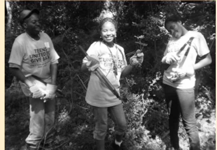
Teen residents clean up the trails of Belle Isle

On May 7, three Lincoln Mews residents participated in Teen Service Day sponsored by the YMCA. The day called for teens (grades 6 -12) to give back to their local parks and schools. Our residents volunteered at Belle Isle, cleaning up trails by getting rid of undergrowth and picking up trash. Community Social Work (CSW) will continue to offer service opportunities at Lincoln Mews.