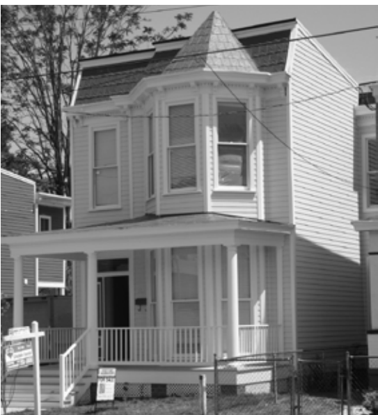
2012 Fairmount Avenue

BHC's newly renovated Queen Anne-style home at 2012 Fairmount Avenue is ready to welcome new first-time homeowners to the Church Hill neighborhood. This affordable home integrates modern energy-efficient features with beautiful historic architecture. The home is also adjacent to BHC's award-winning renovation at 2008 Fairmount (recipient of the 2009 Golden Hammer Award for Best Residential Renovation), making it another key piece of revitalization in Church Hill. BHC held an open house at the home on June 16 during the Center for Neighborhood Revitalization's Renovators' Happy Hour.