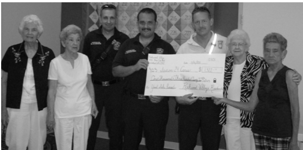
Rockwood Village residents present their check to Station 24